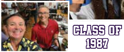
CLASS OF 1987