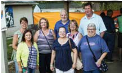
CLASS OF 1977