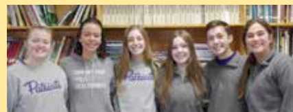
At the State Qualifying meet at North Knox, the English team placed 2nd.