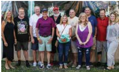
CLASS OF 1982