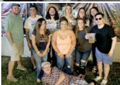
CLASS OF 2012