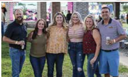
CLASS OF 2002