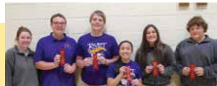
At the virtual Blue Chip Academic Competition, the Social Studies team placed 2nd.

The theme for the Academic Super Bowl for 2022 was "Canada: Our Neighbor to the North"