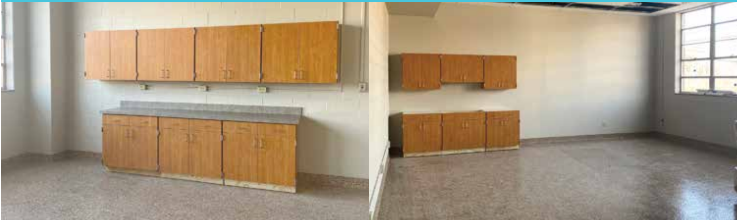
Middle School classrooms

It will soon be one year since our beloved Rivet building was damaged by the powerful storm that devastated our community. We have moved from the overwhelming feelings of shock, desperation, and sadness to excitement, anticipation, and happiness. The building repair is moving along and it looks fantastic. You have heard that sometimes something good can come from a bad, this is definitely one of those times. Not only did we see a community come together to assist each other with storm damage cleanup and rebuild, but we will also be able to welcome your students back to school next year to a new science room that will enhance the learning of our students with the upgraded features and two new middle school classrooms that will function better than ever. Our Rivet family is so thankful for the continued support from our community, alumni, and others that have heard our story. We are so truly Blessed.