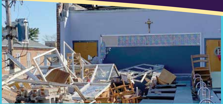
Science room after the storm