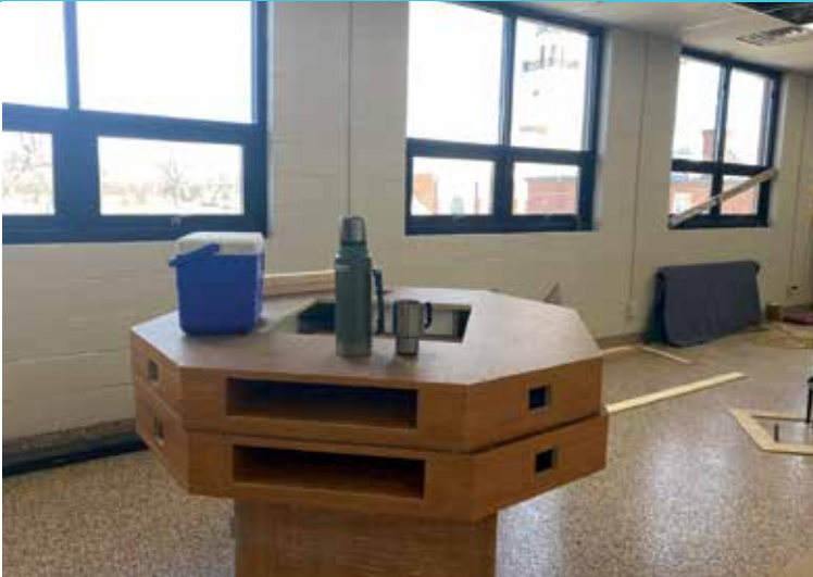
Science room and work stations