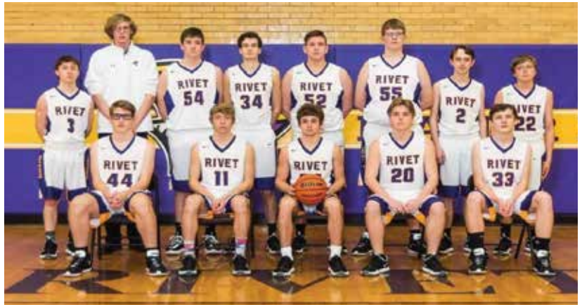
The Rivet Patriots ended their season by losing to Wood Memorial on March 5th in sectionals.