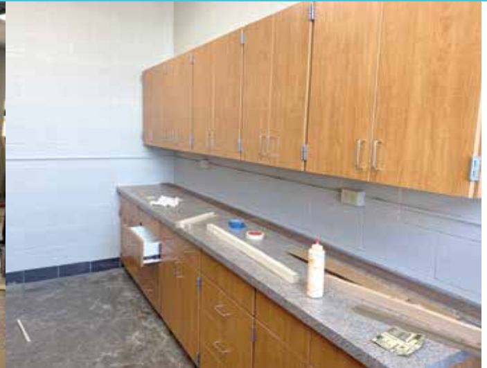
Science room closet