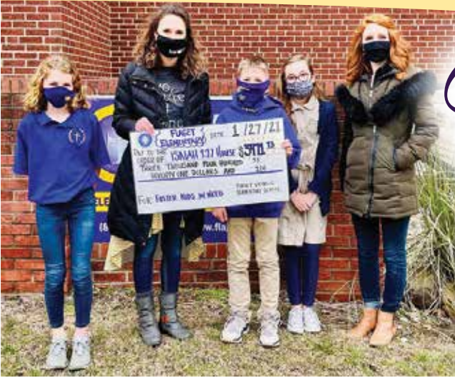
The Flaget Student Council officers proudly presented the Isaiah 1:17 House with a check for $3,471.73 to help foster children in our community. Thank you to everyone who donated during Penny Wars!