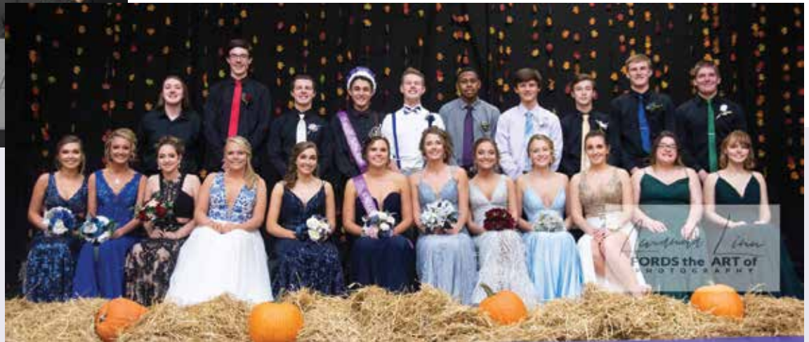
2020 Senior Class at Homecoming