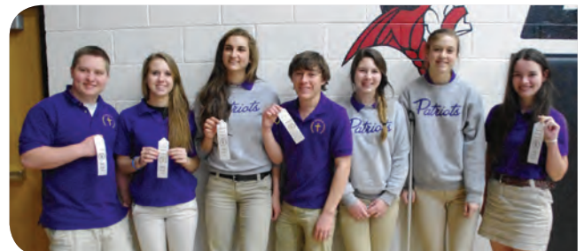
English: 3rd place in Blue Chip