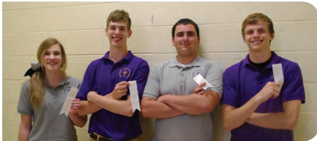
Math: 3rd place in State Qualifying meet (one question away from possibly heading to state)