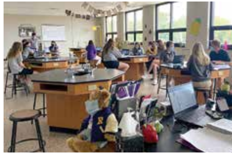
High School Science Room