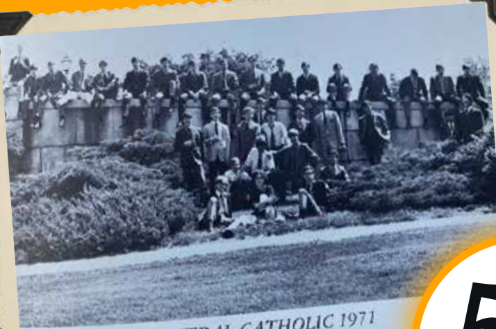
CENTRAL CATHOLIC 1971