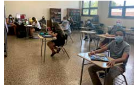
Middle School Math Room