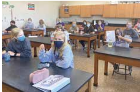
Middle School Science Room