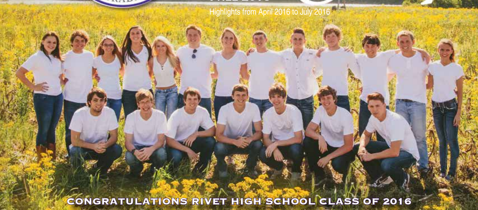
CONGRATULATIONS RIVET HIGH SCHOOL CLASS OF 2016

A Publication of the Vincennes Catholic Alumni Association