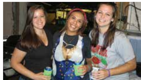
Class of 2012

Don't Forget to Reserve Tables for Your Class Reunion Next Year at Germanfest