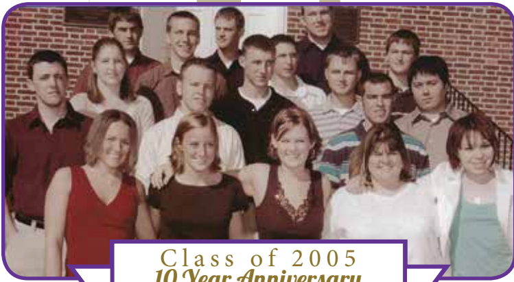
Class of 2005 10 Year Anniversary