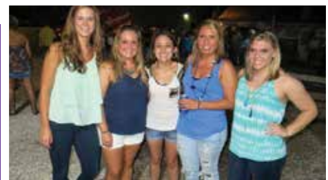
Class of 2010

bis zum nächsten Jahr in Vincennes! See you next year in Vincennes!