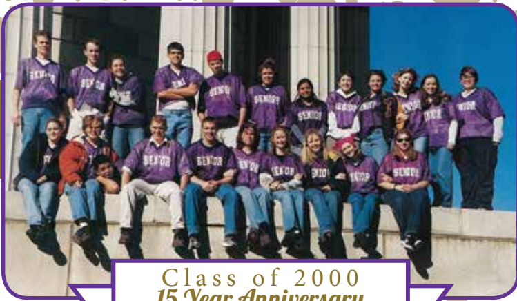
Class of 2000 15 Year Anniversary