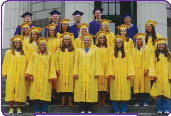
Class of 2010 5 Year Anniversary

We would like to acknowledge these graduate classes on their milestone year!!