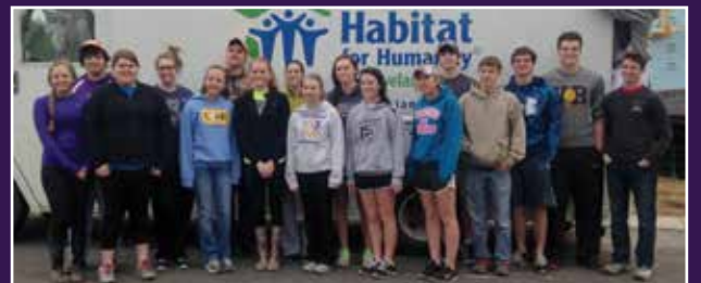
As volunteers for Habitat for Humanity, Rivet seniors spent their 2015 spring break building a home for a family in Cleveland, TN.